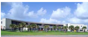
Early Childhood Development Center, TAMUCC