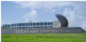
Texas A&M University Corpus Christi